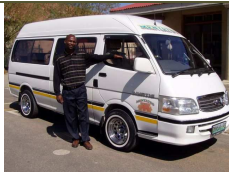
Menyatso Travel & Tourism Taxi Service