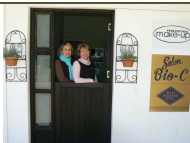
Salon Bio-C Professional & Studio Make-up

Maine Menyatso Tel: 058 481 2140 Cell: 082 340 7767