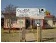
Ons Plek & Papillon Beauty Salon

Massages, Manicures, Pedicures, Gel Nails, Home Industries, Information Center, Self Service Coffee Shop & Gift Shop