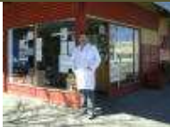
Ster Kafee Supermarket & Bakery